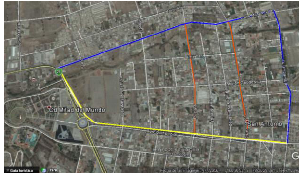
Fig. 1 Area of study, San Antonio de Pichincha